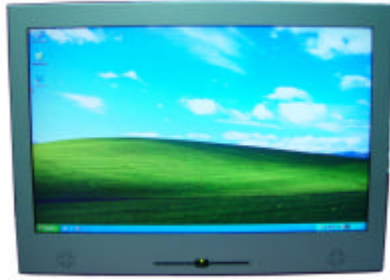
- 100% water-proof front - IP-66, 65, 56, NEMA 4, 12